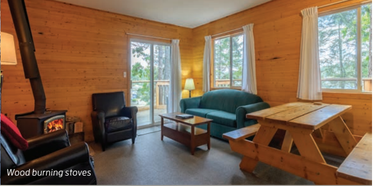
Wood burning stoves