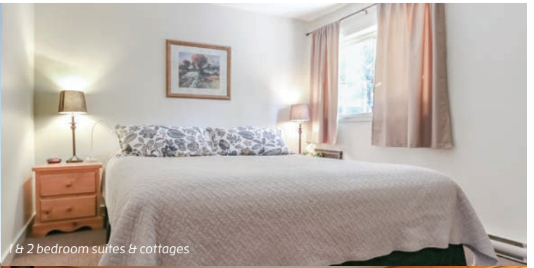
1 & 2 bedroom suites & cottages